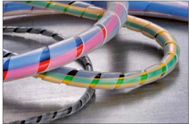
Spiral binding SBTFE - ideal for extreme conditions.